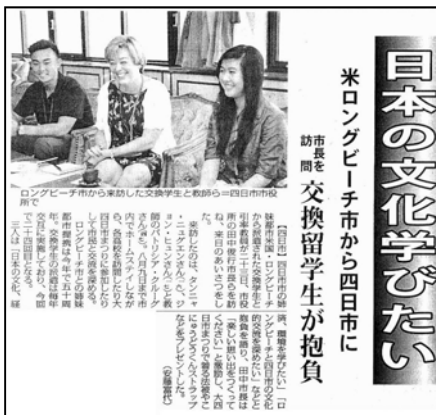
The Trio's visit was covered by the Yokkaichi Press.

This experience also made an impression on me as both a mother and teacher, as I watched the teenagers I accompanied form strong friendships with the teens in Yokkaichi. The interactions between them made all of our excursions just that