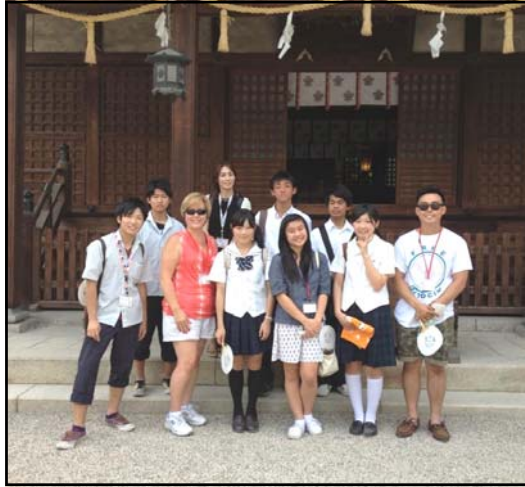
The 2013 Trio with former Yokkaichi Trio members.

much more enjoyable. I think I can speak for all of us in the Trio when I say that this opportunity and the memories we made will forever change our lives.”