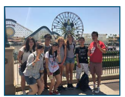
2016 Trio from Yokkaichi with host families.

In alternate years, one teacher and two high school students (16-17) from Long Beach are selected to visit Yokkaichi, Japan as goodwill ambassadors for a threeweek cultural exchange. In alternate years, Long Beach hosts a trio from Yokkaichi.