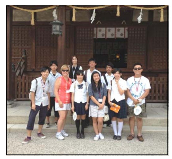
The 2013 Trio with former Yokkaichi Trio members.

much more enjoyable. I think I can speak for all of us in the Trio when I say that this opportunity and the memories we made will forever change our lives."