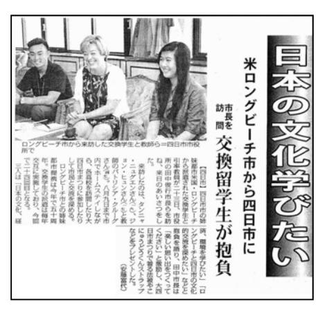
The Trio's visit was covered by the Yokkaichi Press.

This experience also made an impression on me as both a mother and teacher, as I watched the teenagers I accompanied form strong friendships with the teens in Yokkaichi. The interactions between them made all of our excursions just that