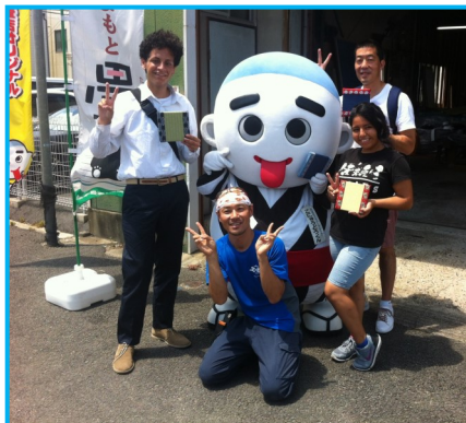
Trio with konyudo-kun (Yokkaichi city's mascot). Kneeling in front: a Japanese floor mat "tatami" maker.