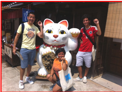
Trio beckoning you to come to Yokkaichi.