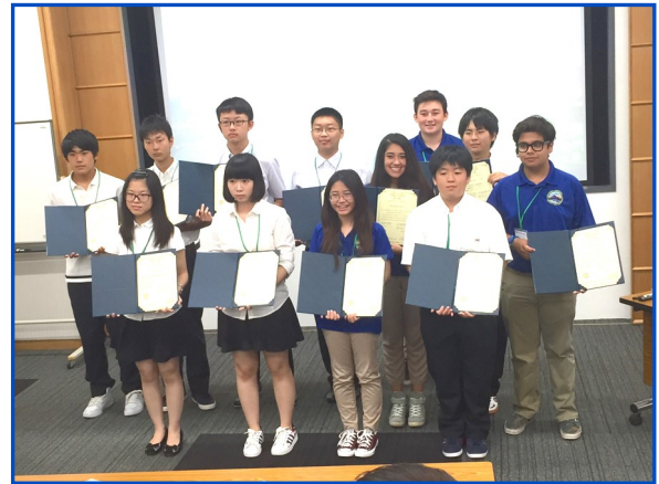
2015 Environmental Summit students (in blue polo shirts) with Yokkaichi and Chinese students.

well informed on environmental issues and Japanese culture prior to their leaving for Yokkaichi and for coordinating the special trip to Nagoya Well done!