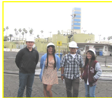
The Trio at THUMS Island.