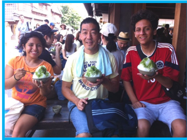
Cooling down with shaved ice in the record breaking summer heat.