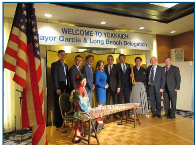
Long Beach Delegation in Yokkaichi

Also present were the Deputy Chairman of the City Assembly, the President of Port Promotion Association, the Chairman of the Chamber of Commerce & Industry, the Director of the Municipal Hospital and the Director of Policy Promotion. The mayors toasted to the longstanding sister city relationship, and over dinner they discussed the importance of strengthening the partnership between Long Beach and Yokkaichi.