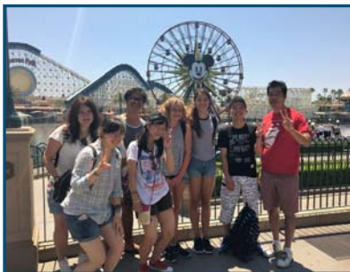
2016 Trio from Yokkaichi with host families.

In alternate years, one teacher and two high school students (16-17) from Long Beach are selected to visit Yokkaichi, Japan as goodwill ambassadors for a three-week cultural exchange. In alternate years, Long Beach hosts a trio from Yokkaichi.