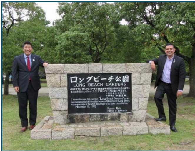
Mayor Mori and Mayor Garcia

Of course, while we were at Long Beach Gardens, we were excited to learn about the vibrant history of the Long Beach-Yokkaichi partnership. We got to see up close the oil pump gifted to Yokkaichi in 1965 to commemorate the sister city relationship.